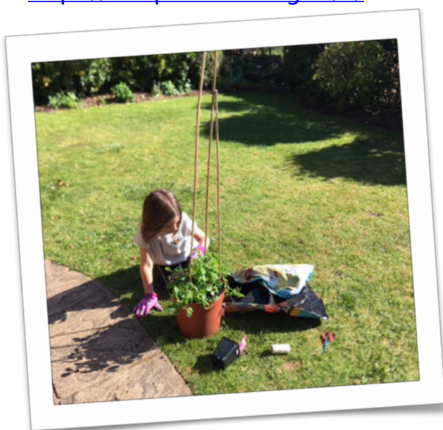
Planting sweet peas