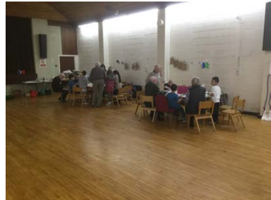
Some of the children doing a daily Craft Activity