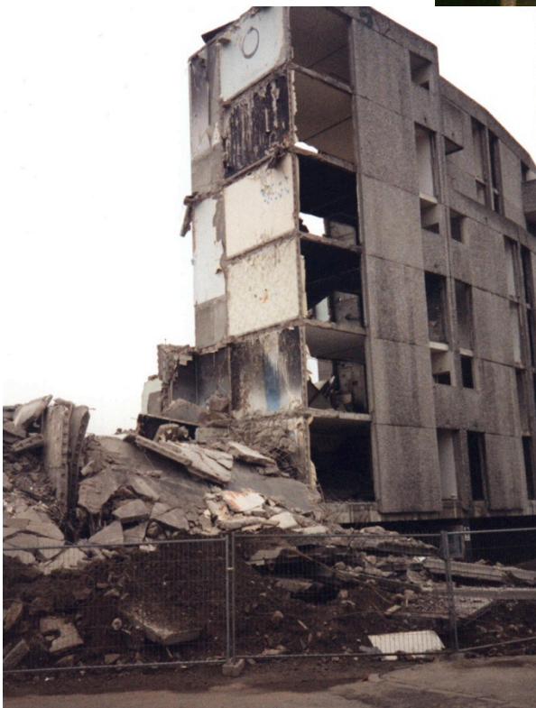
...And The New