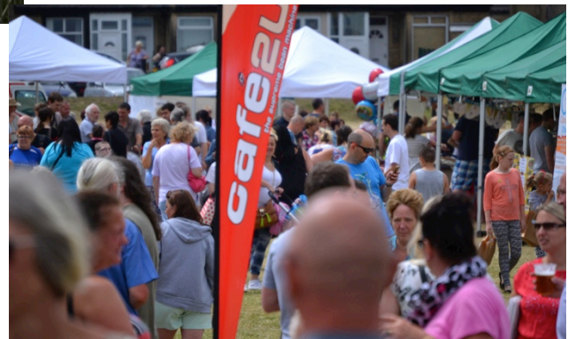
Christmas Lights Switch On Event