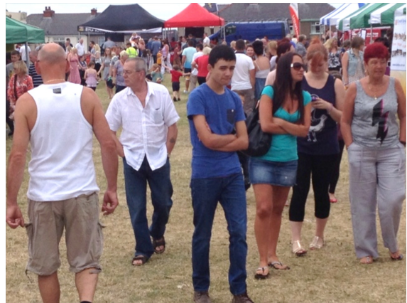
Eccleshill Village Fair

The Bloom in Ecc event has been running for a couple of years, which is designed for local households to take pride in their gardens and enter an annual competition.