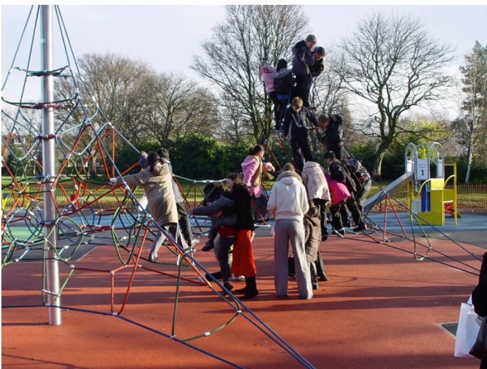
...And The New