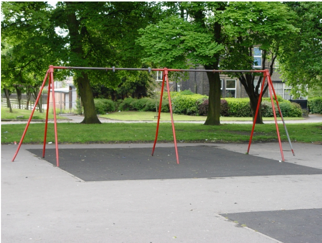
Bradford Moor Park