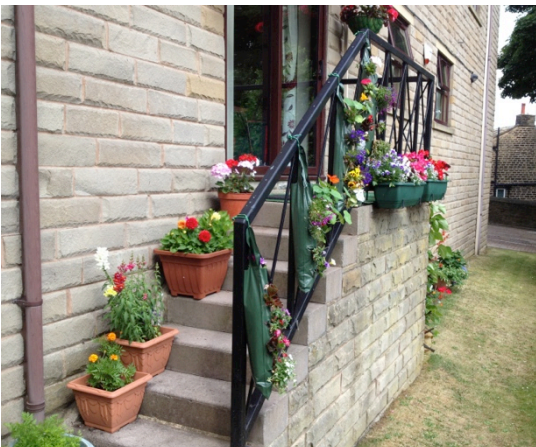
Bloom in Ecc

The Bloom in Ecc event has been running for a couple of years, which is designed for local households to take pride in their gardens and enter an annual competition.