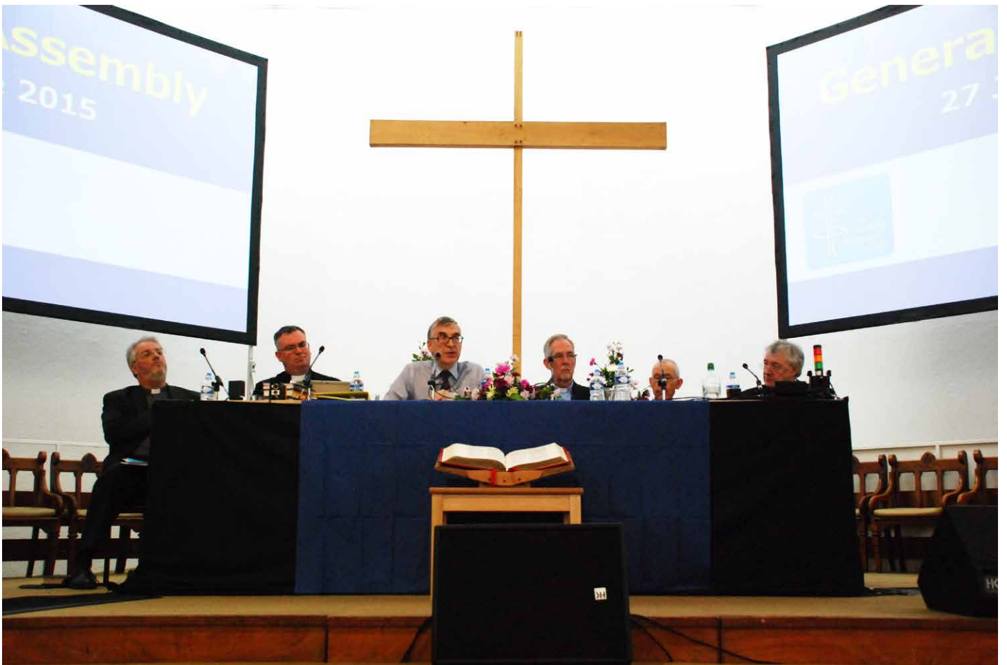
The platform party