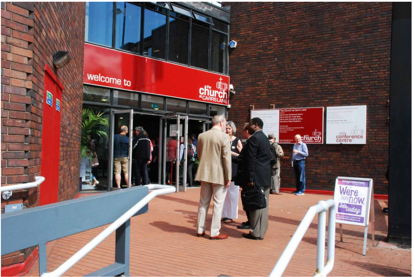
The Church at Carrs Lane, Birmingham