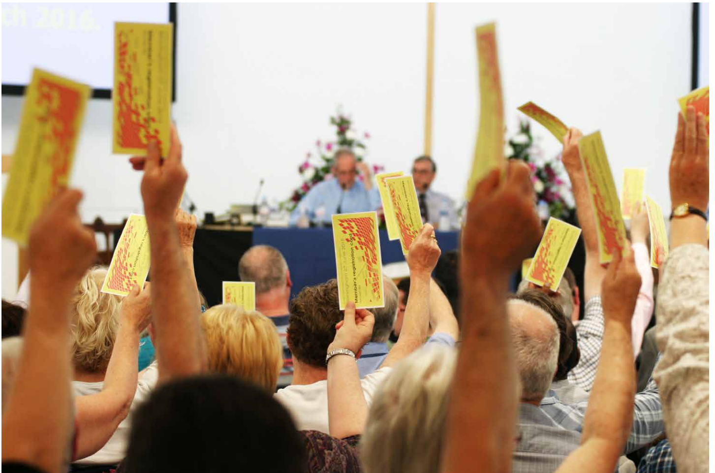
Voting in progress