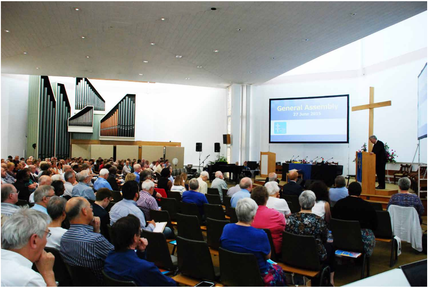
Members of the General Assembly prepare for the day ahead