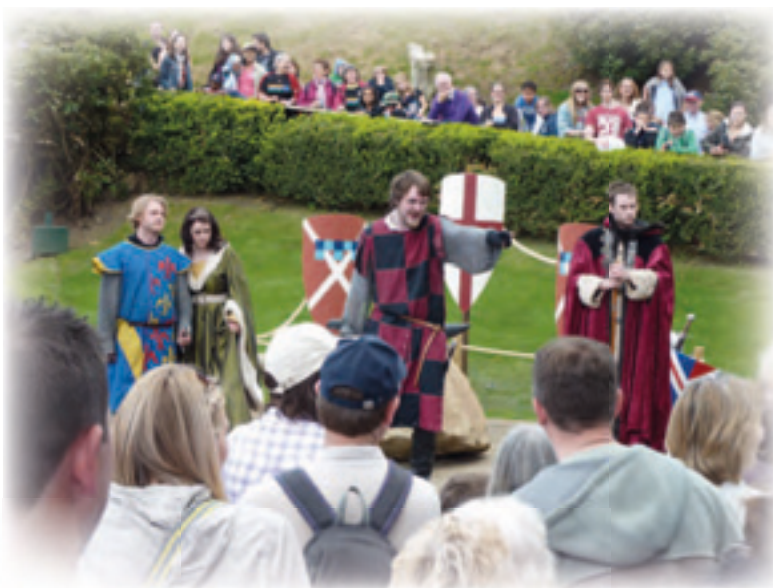
Re-enactments at Warwick Castle