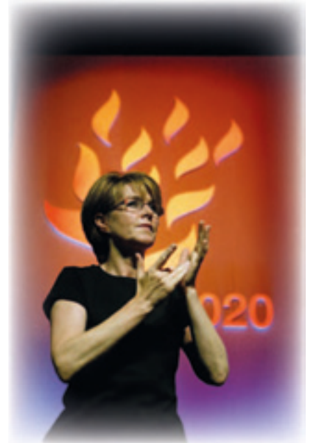
Signers were present throughout the Assembly