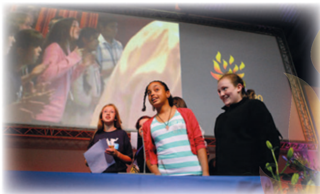
Presentation by the Children's Assembly