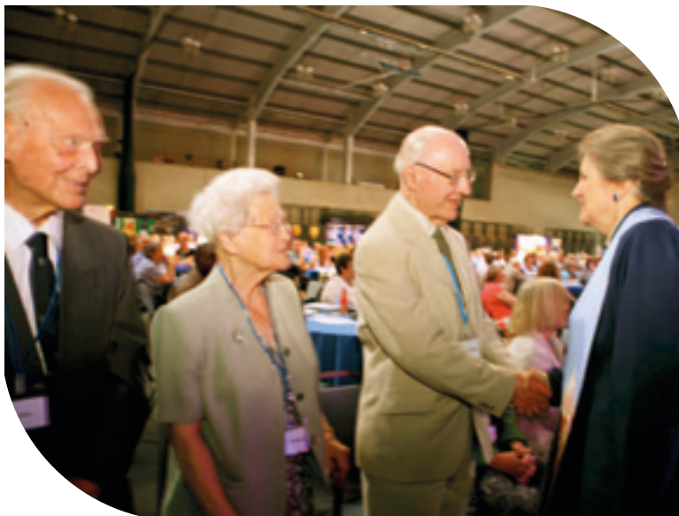
Jubilee Ministers were welcomed by the Moderators and General Assembly

Assembly adjourned briefly and then resumed with the report of the Mission Council.