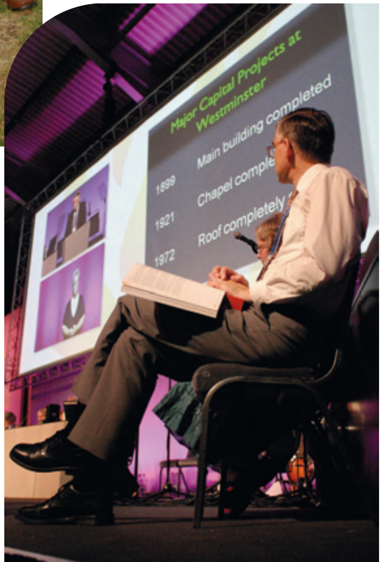
Westminster College appeal presentation