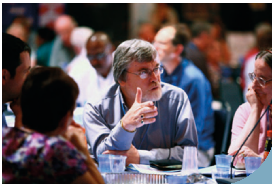
Discussions at Assembly