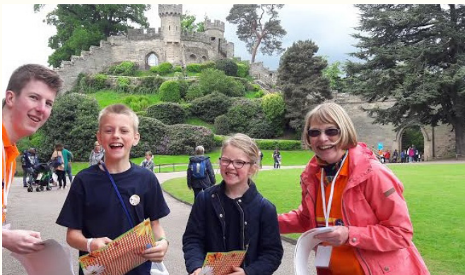
The Big Day Out 2017, Warwick Castle

The URC may be a relatively small Church, but its achievements – both locally and nationally – are substantial. We are ‘punching above our weight’ in many areas, not least in our commitment to social justice, illustrated through the work of the Joint Public Issues Team (JPIT) in areas as diverse as foodbanks, housing and refugees; the continuing innovation of the church related community work (CRCW) programme; large scale events like The Big Day Out and the URC’s associate partnership in the Greenbelt festival as well as initiatives like the celebration of Constance Coltman’s centenary and Walking the Way 1 . Alongside all these high profile success stories is the support of local churches, not least through funding the stipends of ministers and ensuring they are assured of reliable pensions and adequate housing in retirement. And, in addition to these things, we also invest in the long-term future of individuals – from training our ordained ministers and lay preachers to giving advice to new church treasurers.