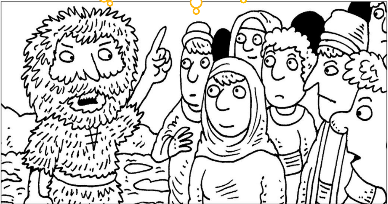
Illustration by lambsongs.co.nz via www.freebibleimages.com

I wonder why some people might not feel happy about John's message?