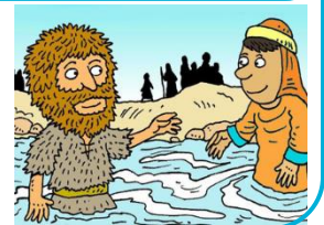
Illustration by Lambsongs.co.nz via freebibleimages.com