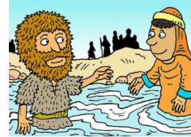
Illustration by lambsongs.co.nz via freebibleimages.com