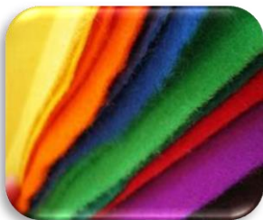
Pieces of fabric of all difference colours