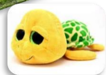
Toy animals, birds and sea creatures