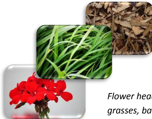
Flower heads, grasses, bark etc