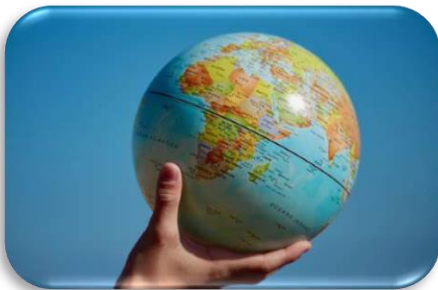
A globe or simple map

Something with rainbow colours for God's promise