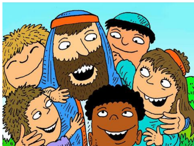
Illustration from lambsongs.co.nz